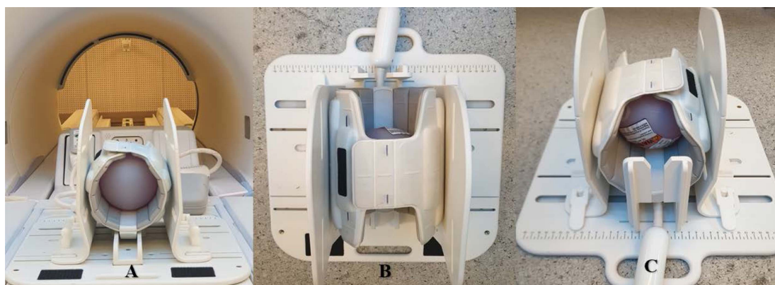
Fig. 4. (Color online) Arrangement of spherical phantom, fixed frame (A), and coil with surface coil wound (top view B, front view C).