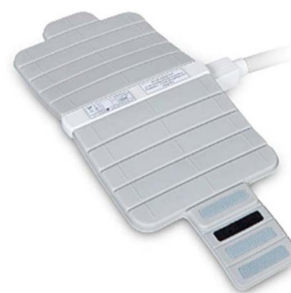
Fig. 1. (Color online) 16-channel GE GEM flex coil 16-S array compact product line for analysis of image quality according to distance from MRI bore center.

The conditions of T1 Weighted Imaging (T1WI) were TR 500 ms, TE 20 ms, Slice thickness 5 mm, Slice gap 5