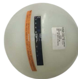
Fig. 2. (Color online) MRI-specific phantom for image quality evaluation (including MRS 4.38 Sphere solution phantom).