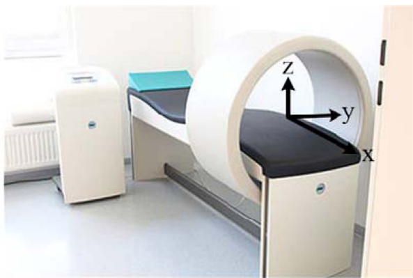
Fig. 1. (Color online) Quattro Pro PMT for magnet therapy with marked vector coordinates.