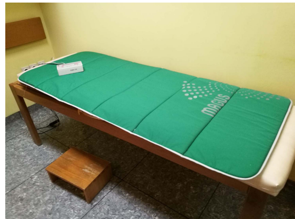
Fig. 3. (Color online) Magus device for PEMF therapy used for placebo therapy – the operating white box control device and the magnetotherapeutic green mat were disconnected.

In studies on the effects of EMF on biological tissues a requirement has been determined for precise presentation of the therapeutic EMF parameters [25]. With the assistance of the Faculty of Electrical Engineering and Computer Science University of Maribor measurements