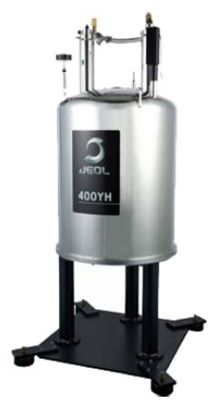
Fig. 1. (Color online) FT-NMR 400 MHz Spectrometer used in the total fluorine content of fluoride toothpaste.

operating at 376.17 MHz, equipped with a dedicated 5mm spinning probe (Fig. 1). The probe temperature was 23 °C. Typical spectral parameters for this study were as follows: 90° pulse width, 6.74 \mu s; relaxation delay, 5 s; acquisition time 83.88 s. A known amount of D<sub>2</sub>O (100 \mu l) was added as an internal field frequency lock.